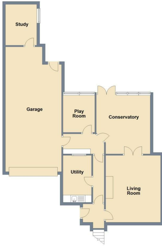
Lower Ground Floor Approx. 59.2 sq. metres (637.6 sq. feet)